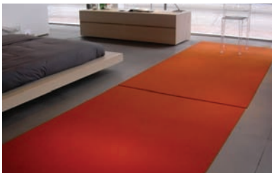
TOP: Kasthall Hagg MIDDLE: Ruckstuhl Loft BOTTOM: Ruckstuhl Feltro

and product development. Kasthall takes an active responsibility for the environment and is environmentally certified according to the ISO 14001 standard. The company makes continuous improvements to benefit the environment, from creating a healthy workplace to helping preserve the beauty of nature. For more information about Kasthall, visit www.kasthall.com .